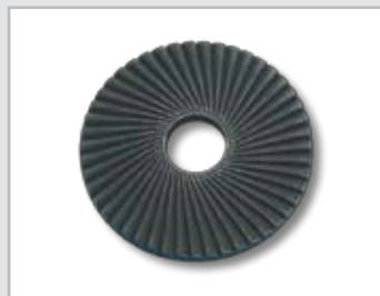
Special safety washer